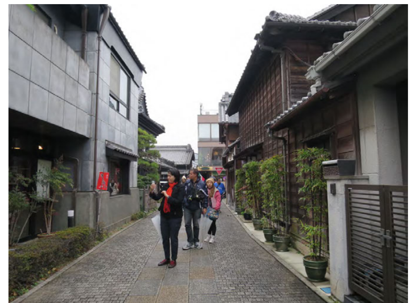
One-day trip to Kawagoe