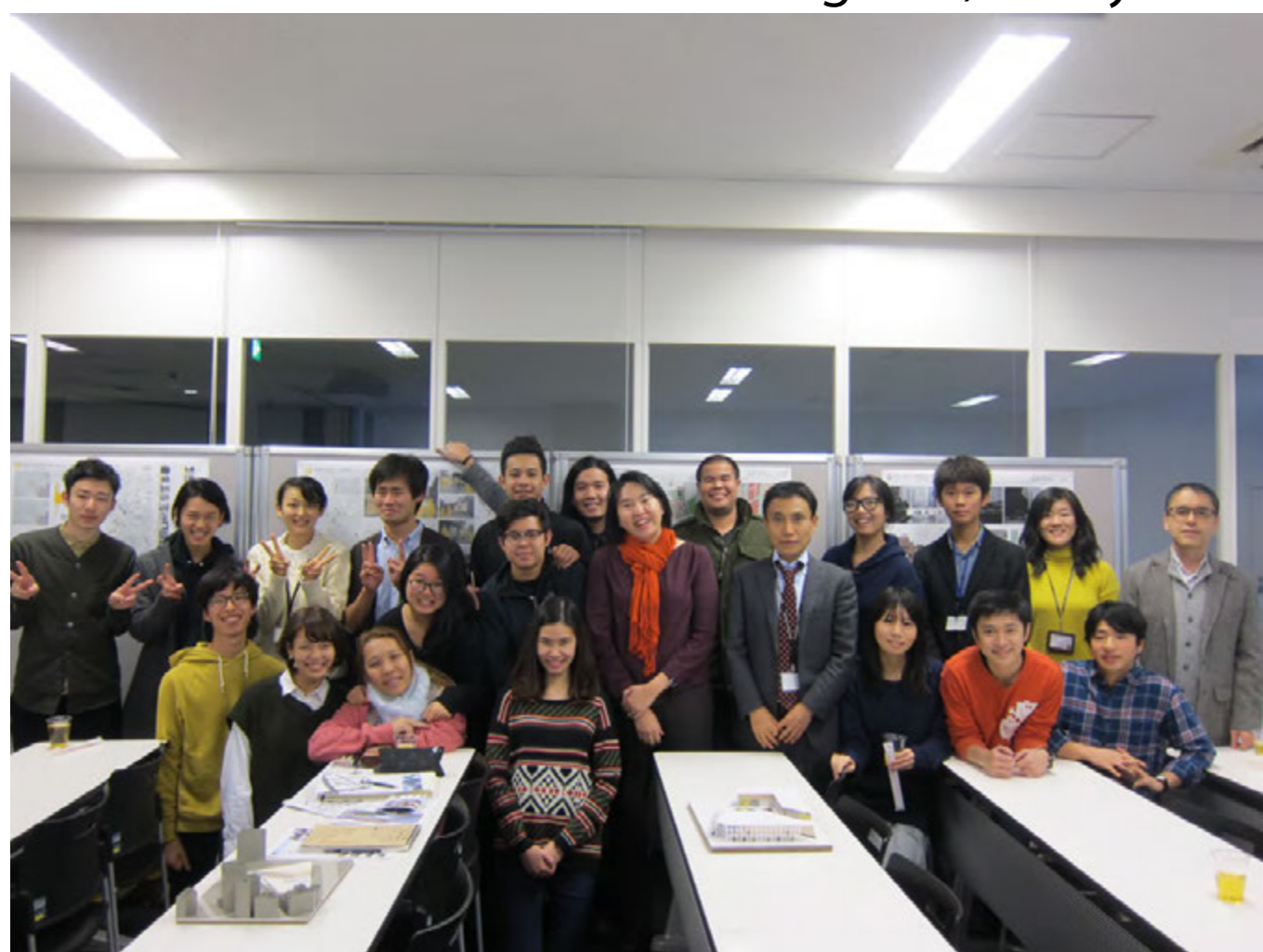
SIT and KMUTT