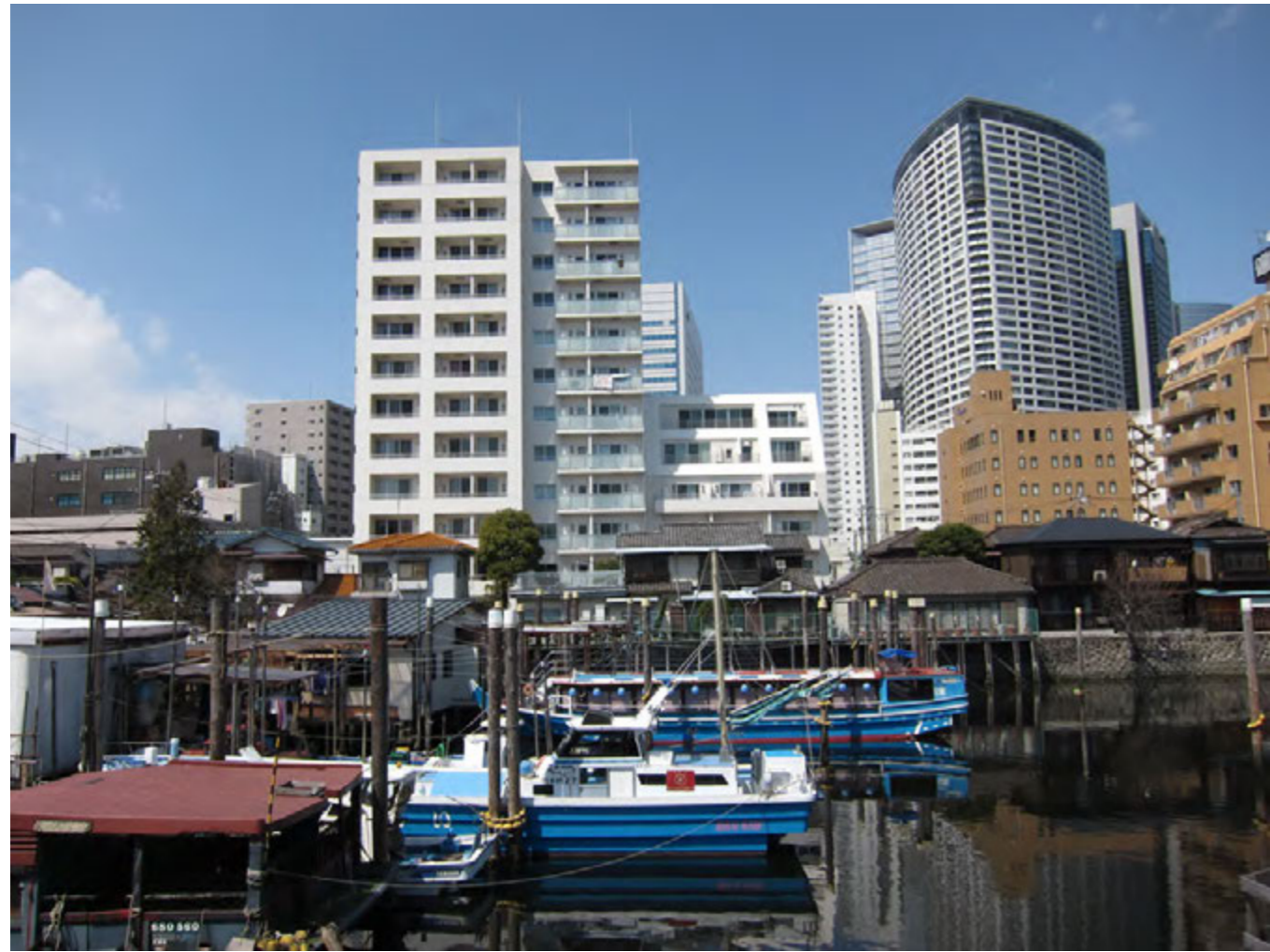
Kita-shinagawa, study area

King Mongkut's University of Technology Thonburi School of Architecture and Design