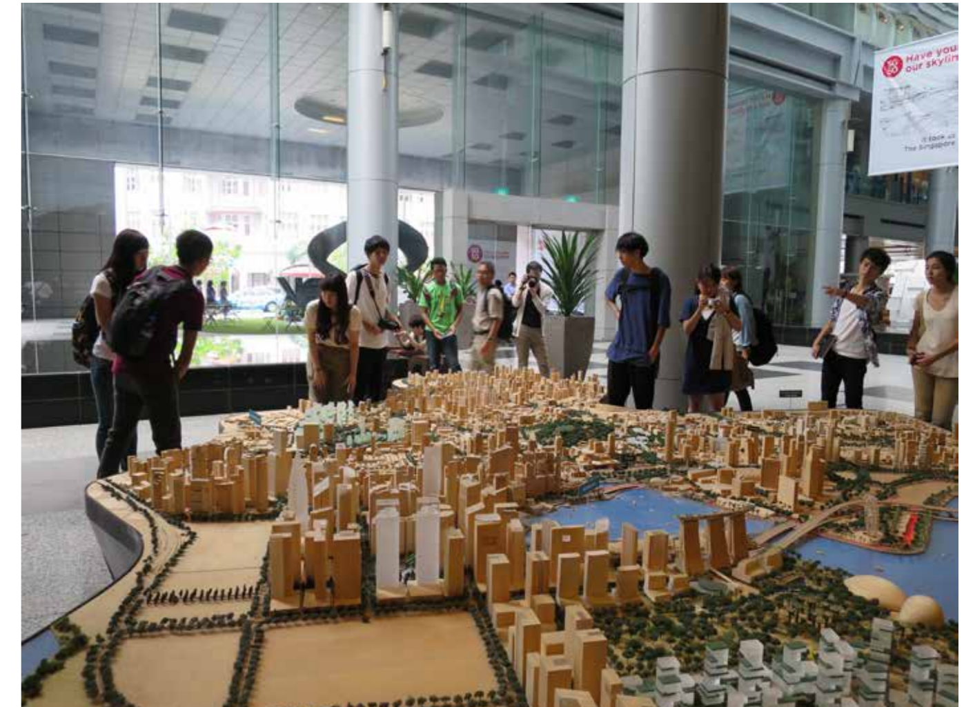
One-day trip to Singapore