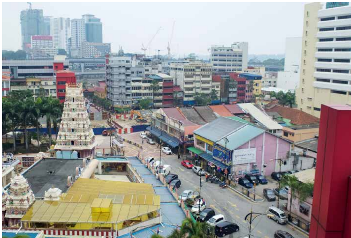
Study area, Johor Bahru old town

Shibaura Institute of Technology Department of Engineering and Design Universiti Teknologi Malaysia Department of Landscape Architecture