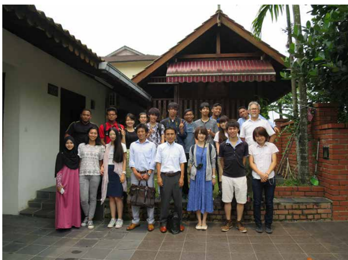
SIT and UTM