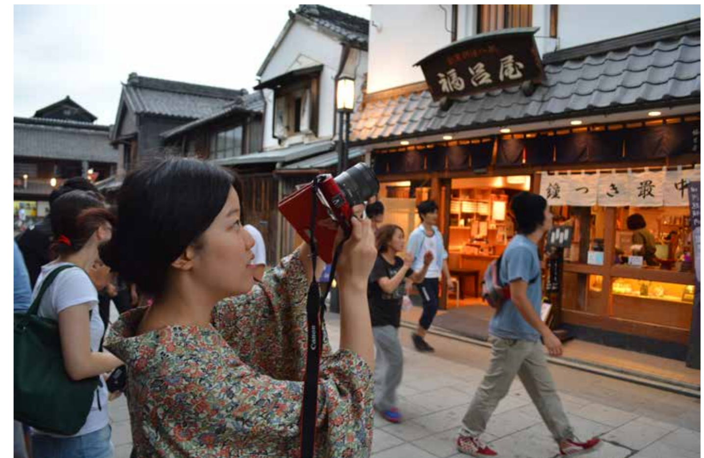
Kawagoe one-day trip, Tokyo 2014