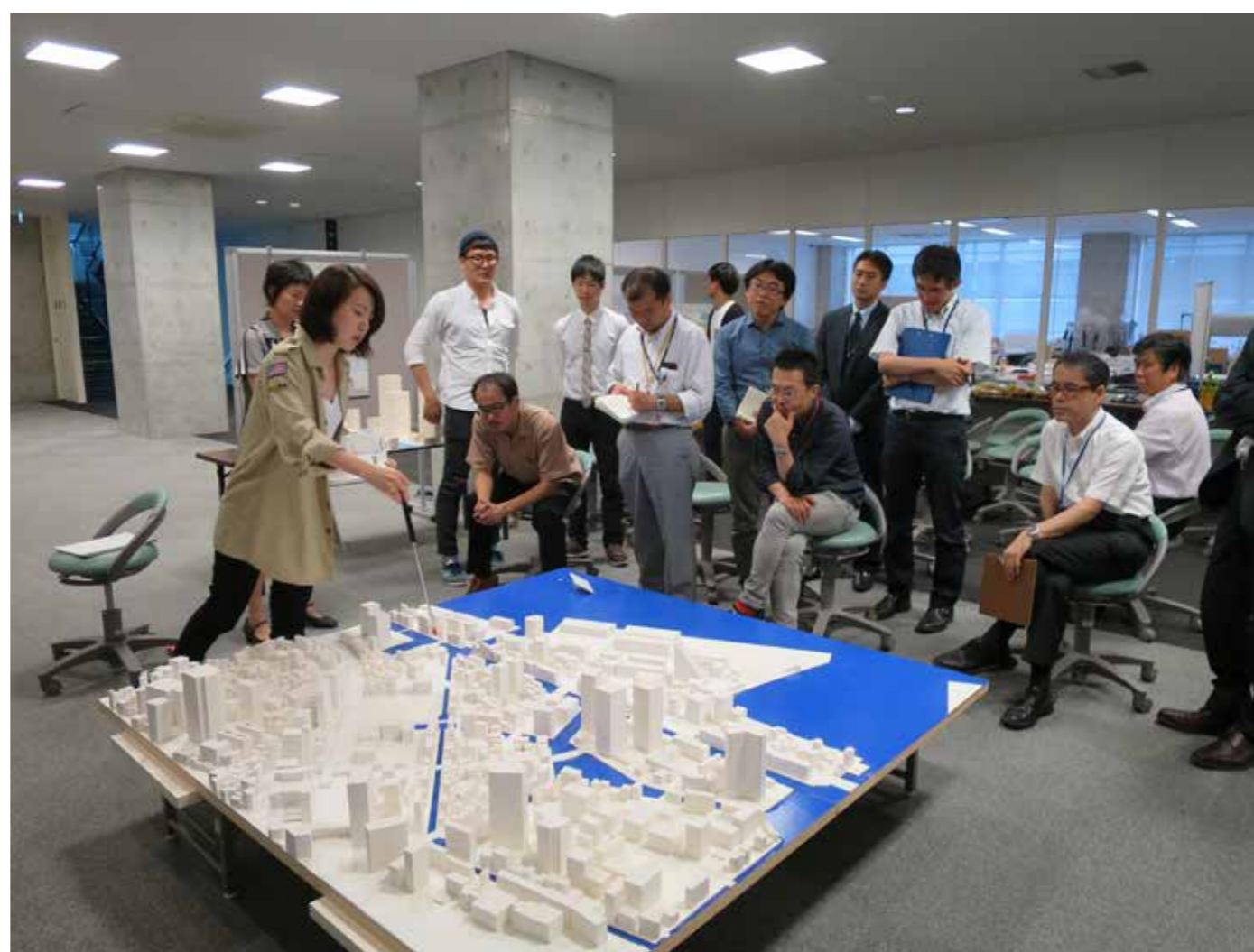
Critic, Tokyo 2014