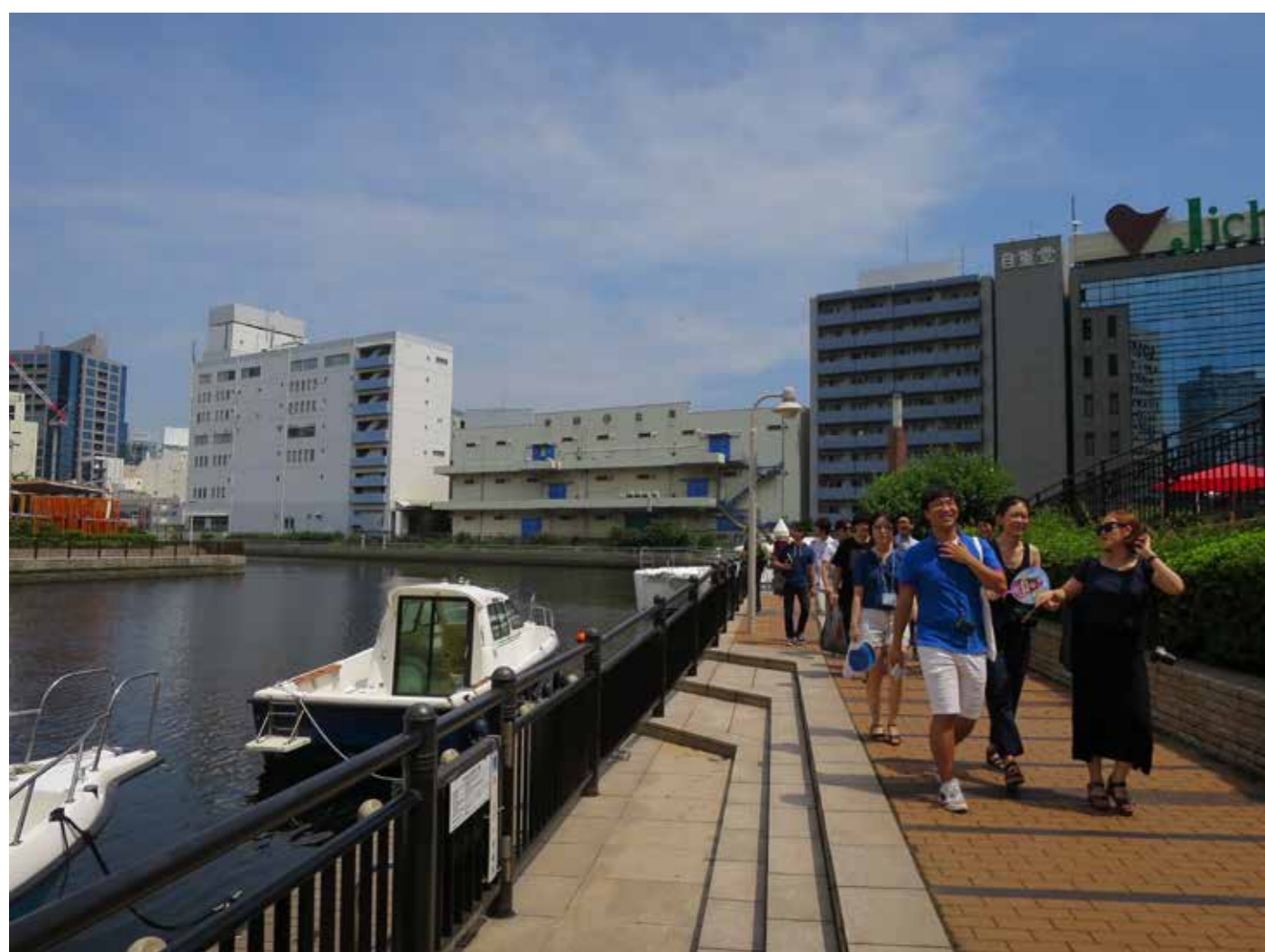
Shibaura, Tokyo 2014 site visit