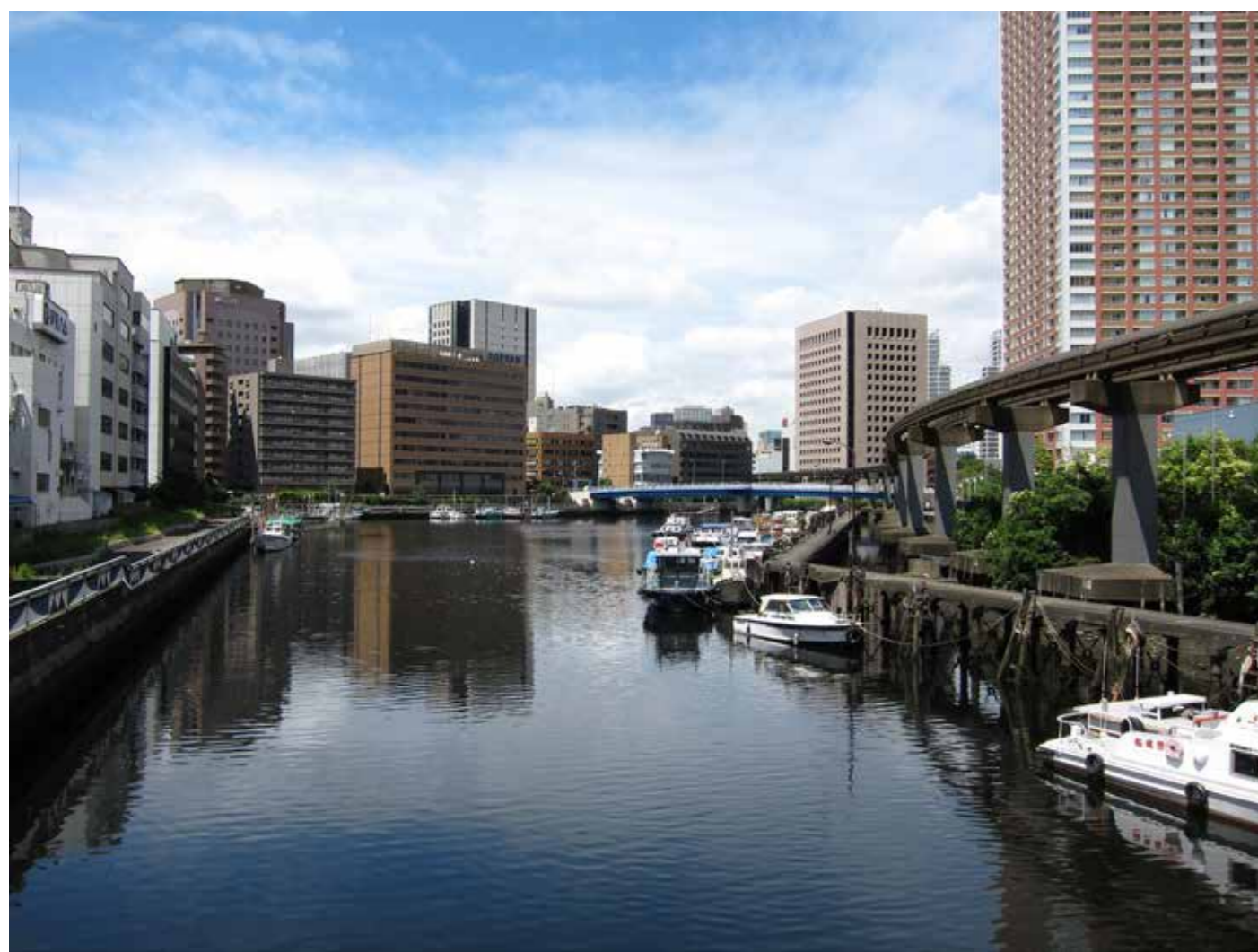
Shibaura, Tokyo 2014 study area