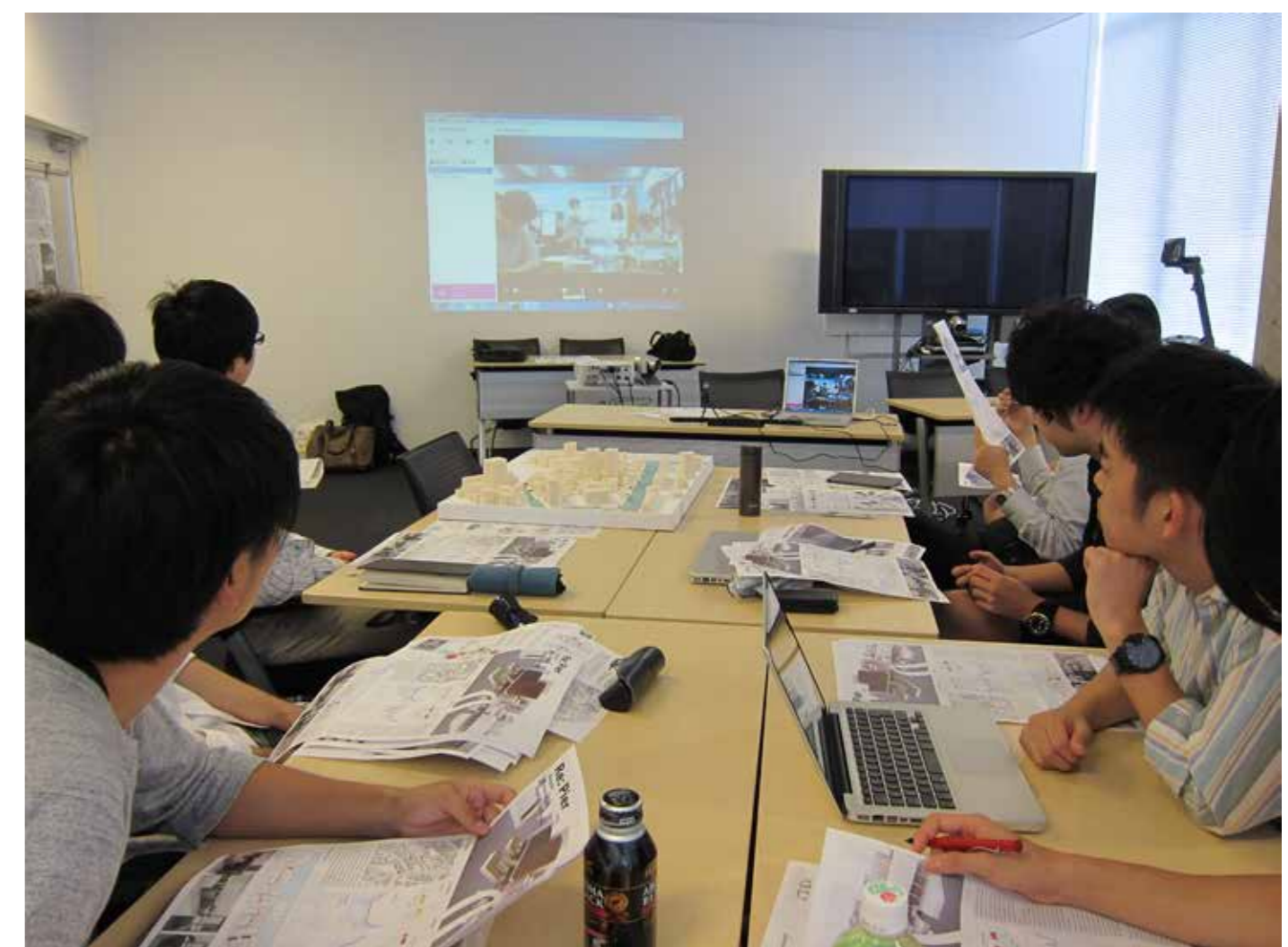
Tokyo-Seoul Skype, 2014

International Exchange Workshop of Architecture and Urban Design began in 2012 between Shibaura Institute of Technology (SIT) Department of Engineering and Design, and Chung-Ang University (CAU) School of Architecture and Building Science to pursue vision of East Asian cities. The Workshop held the first program 2012 summer in Seoul and the second 2014 summer in Tokyo. SIT eight and CAU eight students worked together at SIT in Tokyo, August 21-29, 2014. The 2014 workshop worked on Shibaura District neighboring SIT in Minato Ward between the CBD and waterfront of Tokyo. 'Minato' says a port in Japanese and Shiba-ura means area behind Shiba District. Its landscape is dynamic mixture of business development, high-rise condominiums, traditional streets and industrial sites in canal web. Asian cities changing find within the heart such transitional areas potential to contribute urban diversity. Four groups respective of SIT two and CAU two students found blocks adjacent to canals as their working site, completed concepts and master plans during Tokyo session August 21-29, and later developed schematic designs at home till the Internet presentation between Seoul and Tokyo on September 27.