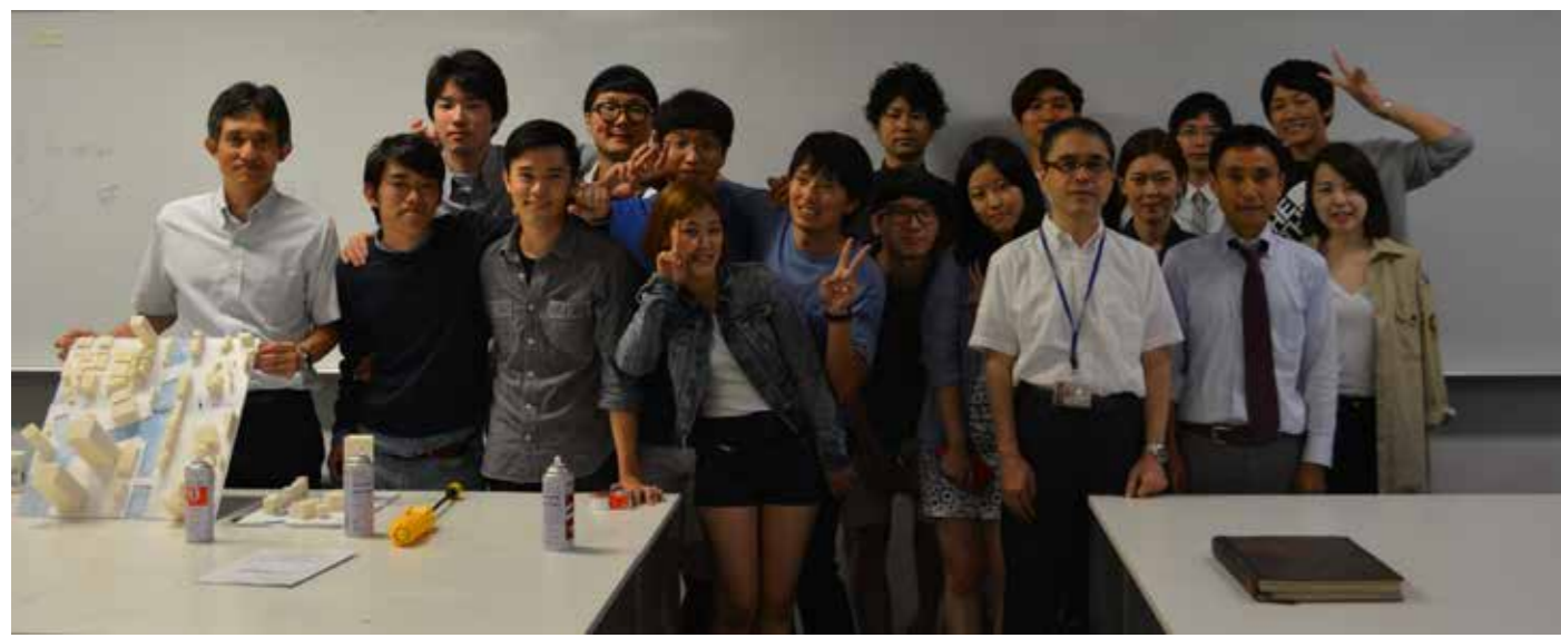
SIT and CAU, Tokyo 2014

Shibaura Institute of Technology Department of Engineering and Design Chung-ang University School of Architecture and Building Science