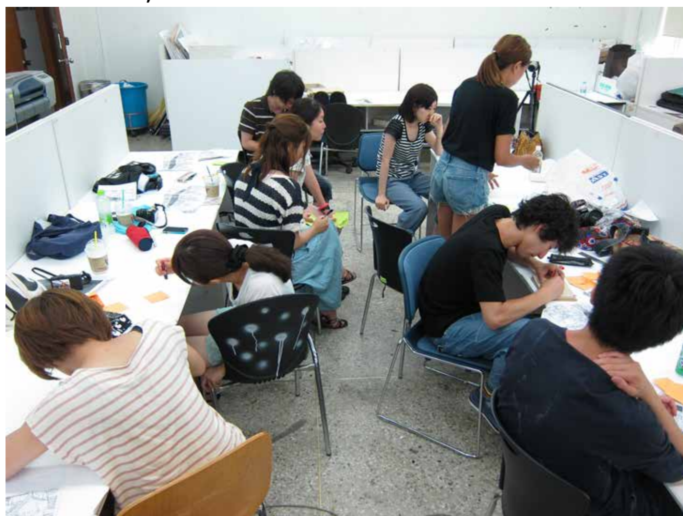
Studio, Seoul 2012