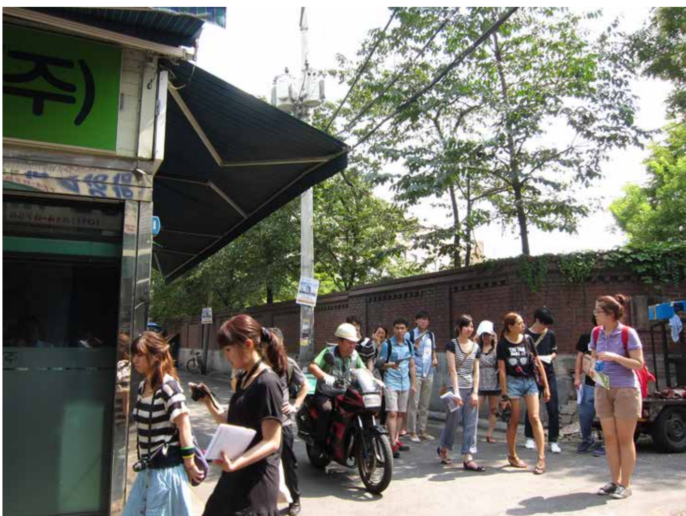
Site visit, Seoul 2012