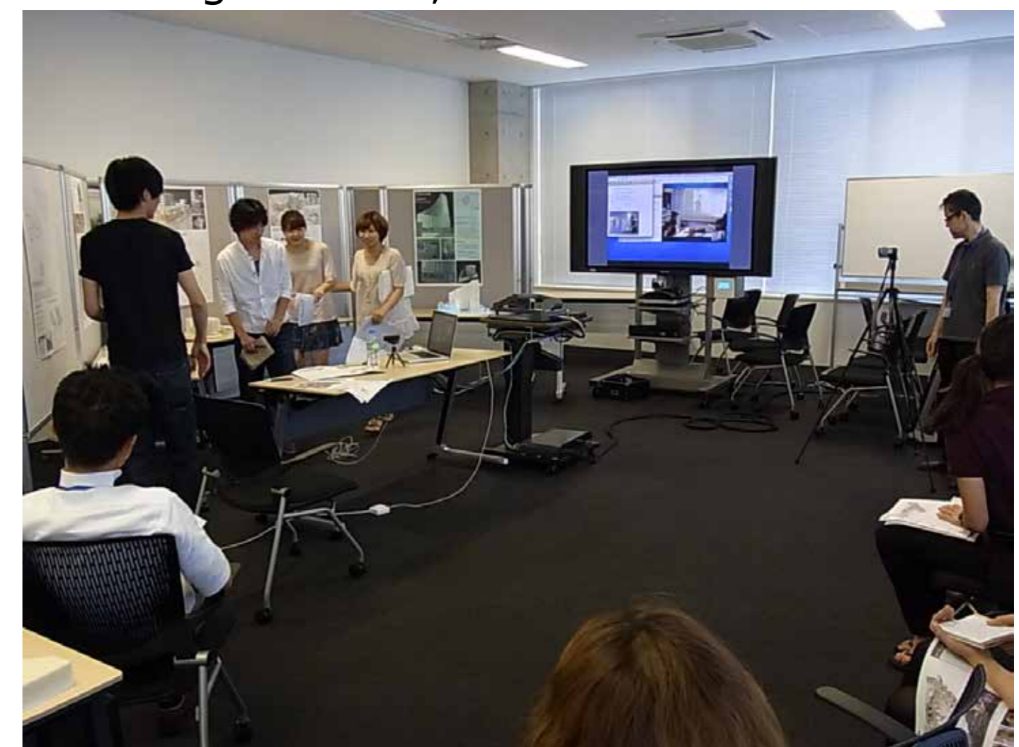
Tokyo-Seoul Skype, 2012