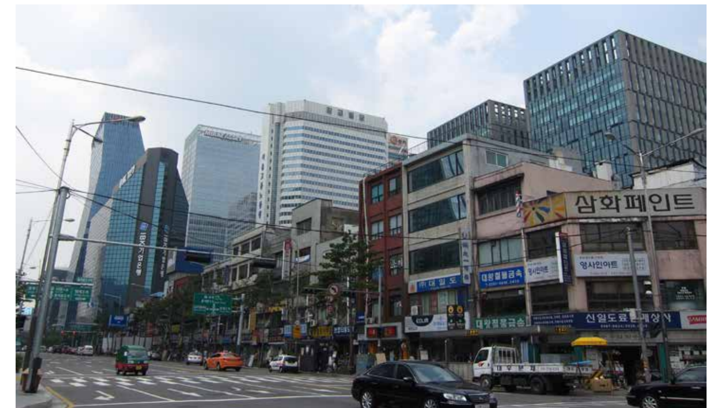
Euljiro, Seoul 2012 study site