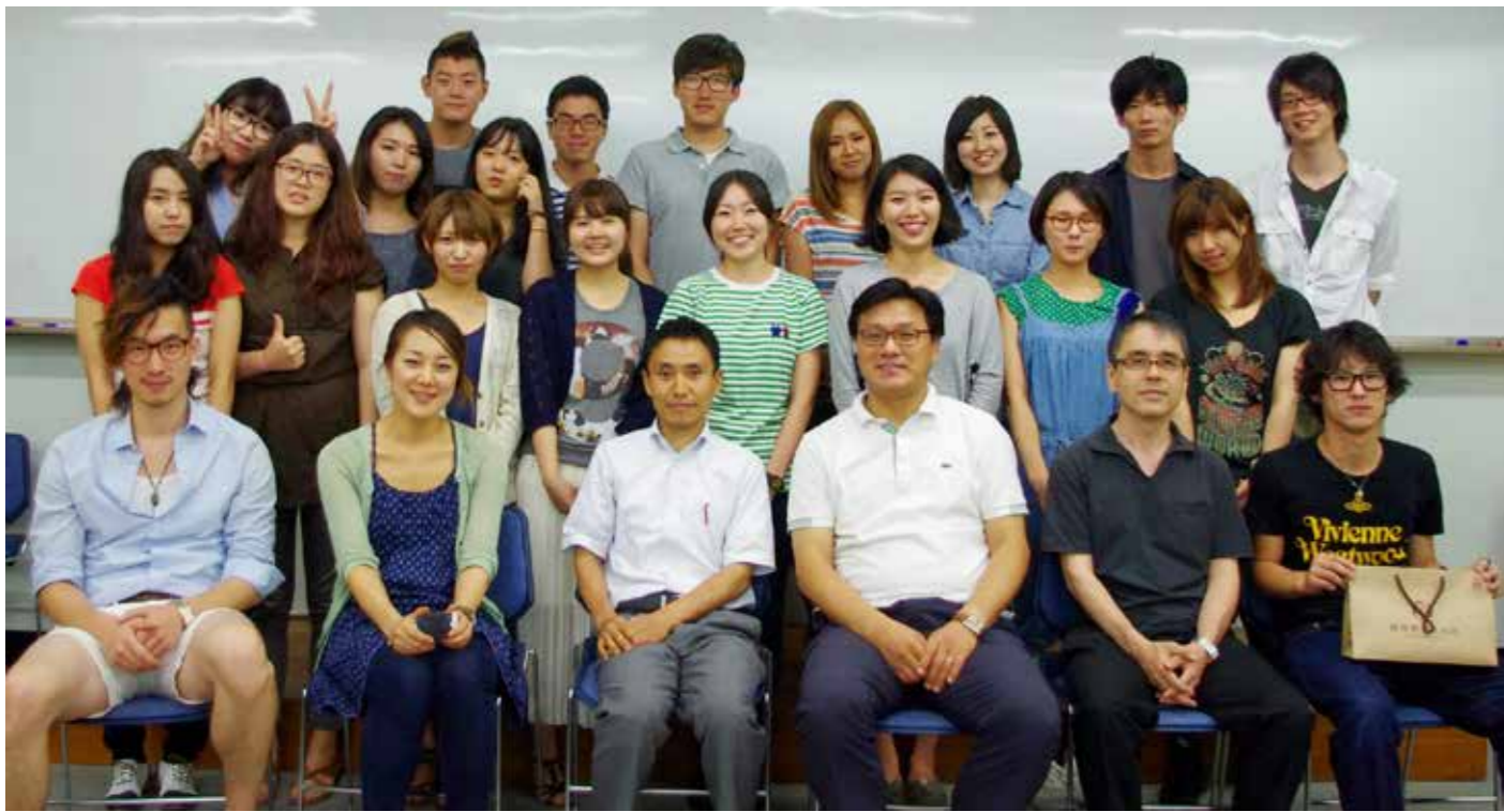
SIT and CAU in Seoul 2012

Shibaura Institute of Technology Department of Engineering and Design Chung-ang University School of Architecture and Building Science