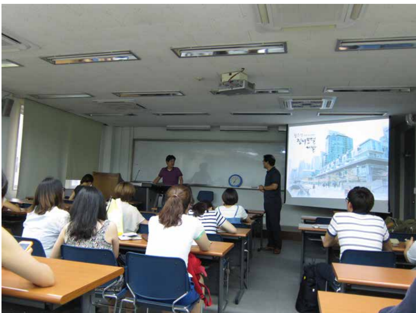
Visiting lecture, Seoul 2012